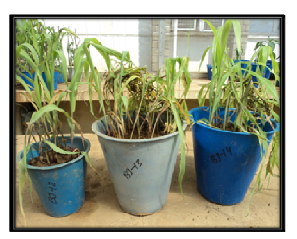
Plate 3. Reactions of maize lines to R. solani f. sp. sasakii under pot conditions

Kar (1998) reported inbred maize lines CM117 and CM211 as resistant to banded leaf and sheath blight caused by R. solani f. sp. sasakii and Bhavana and Gadag (2009) also reported inbred lines Pop 145 and Suwan-1 with high degree of tolerance to BLSB.