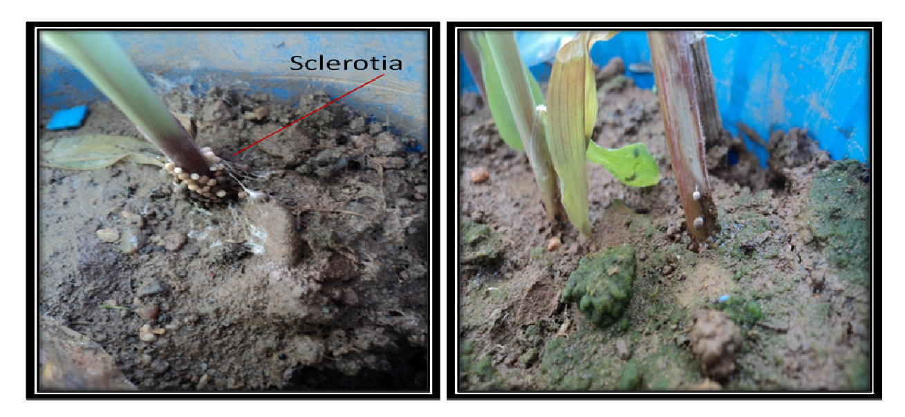
Plate 1: Dull brown sclerotia at basal sheath of inoculated maize seedlings