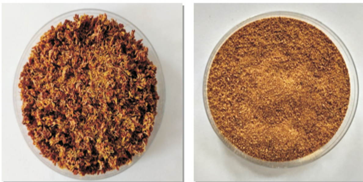
Fig. 1 Germinated garden cress seeds and powder

All the analysis work was carried out in triplicate so as to reduce the experimental error and subjected to statistical analysis for one way analysis of variance